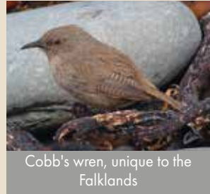
Cobb's wren, unique to the Falklands

To prevent the spread of invasive species and diseases, you are asked to comply with a few simple measures when travelling around the islands: make sure all of your clothing, equipment and luggage is free from soil, animal faeces, seeds, insects and rodents, and scrub your footwear before each visit to a new wildlife site or seabird colony. If you have any questions about biosecurity, or wish to report diseased wildlife, please speak to the landowners or call the Department of Agriculture 27355 / Falklands Conservation 22247 for advice.