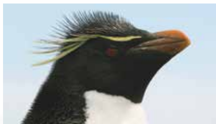
Southern rockhopper penguin