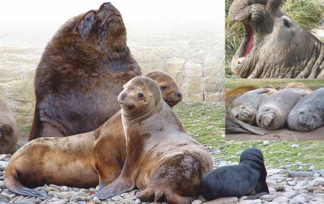
Southern elephant seals