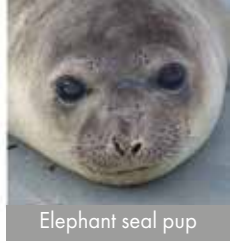
Elephant seal pup

The Elephant Seal Research Group currently run long-term monitoring of the seals and killer whales at Sea Lion Island: www.esrg.org